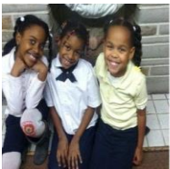
Schenley Heights Community Development Program